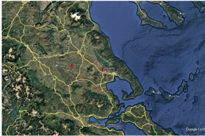
Figure 1: Locations of experimental fields in Thessaly plane, central Greece.

before sowing, basic fertilization with the required amounts of phosphorus and potassium for each area according to soil analyses, and application of pre-emergence and post-emergence herbicides, as well as protection from pests and diseases.