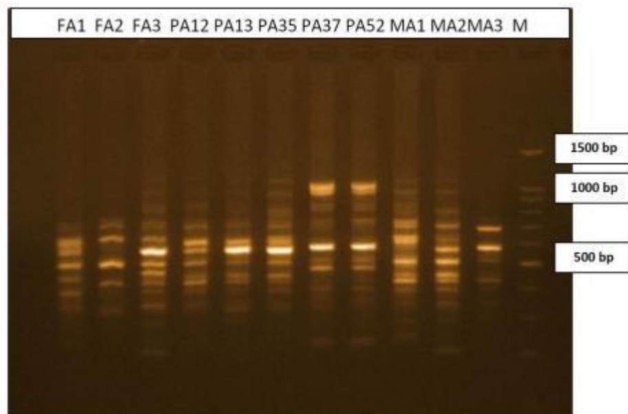
Figure-1: Amplified bands across using K11 ISSR primer. Genetic similarity. M: DNA molecular weight 100bp ladder

The results showed that the lowest percentage of genetic similarity was 0.27 between the hermaphroditic genotype PA52 and the female genotype FA3, also between the male genotype MA3 with the female genotype FA2. The highest percentage of genetic similarity was 0.77 between the two hermaphroditic genotypes PA52 and PA37. The average of genetic similarity between female and male P.atlantica genotypes was 0.326, whereas it was 0.395 between female and hermaphroditic genotypes, and 0.412 between male and hermaphroditic genotypes, which means that the genetic similarity between the hermaphroditic genotypes and both of male and female genotypes was somehow equivalent. Genetic similarity among each of sexual structure was as following: 0.588 among hermaphroditic genotypes, 0.655 among female genotypes and 0.568 among male genotypes (table- 2). In comparison with previous studies Mahmoodnia and Malekzadeh (2017) indicated to genetic similarity percentage ranged between 25- 78% across 12 ISSR primers on 56 male and female pistachio genotypes. Turhan-Serttas and Ozcan (2018) indicated to a high genetic similarity 0.9333 between two Pistacia lentiscus genotypes.